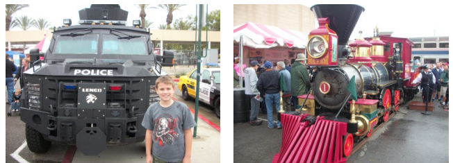
Railroad Days

Southern California Scenic Railway Association, colloquially known by its longtime members as “Scenic” or “The Club,” will remain in our hearts forever.