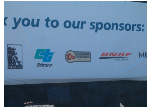
Banner acknowledging the Fullerton Train Museum at the Amtrak event at the station.