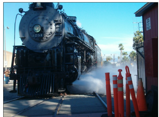
ATSF 3751 Arrives at the Station!