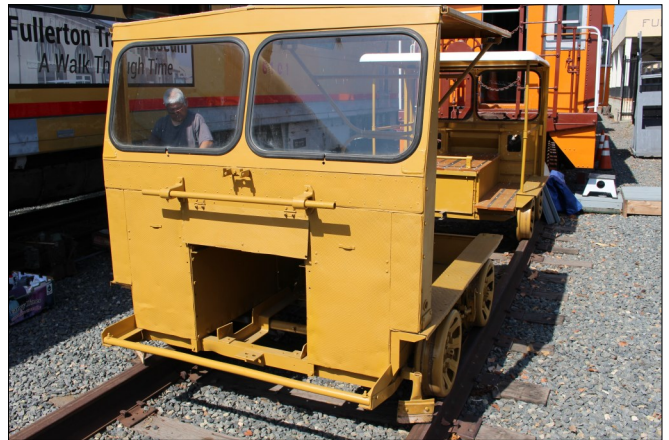
Front of the powered speeder awaiting engine

What replaced the speeder is the familiar use of pickup trucks with cab-activated steel wheels that are lowered making contact with the rails when the crew leaves the pavement attending to a repair. While on steel wheels, the truck's conventional tires make rail contact powering the truck.