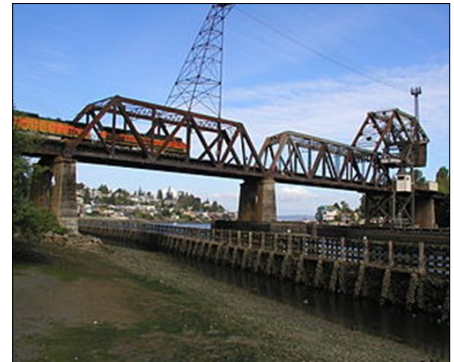
Bridge Four, Ballard Locks, one of Charles' dependents and typical Sound Transit station.