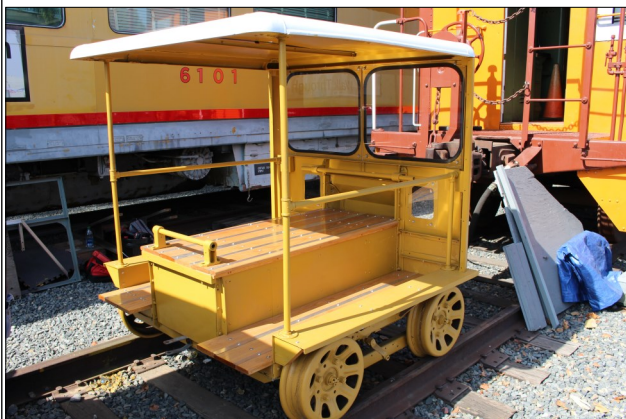
Completed passenger speeder

Our restoration crew has restored two six passenger speeders, keeping one powered and convert-