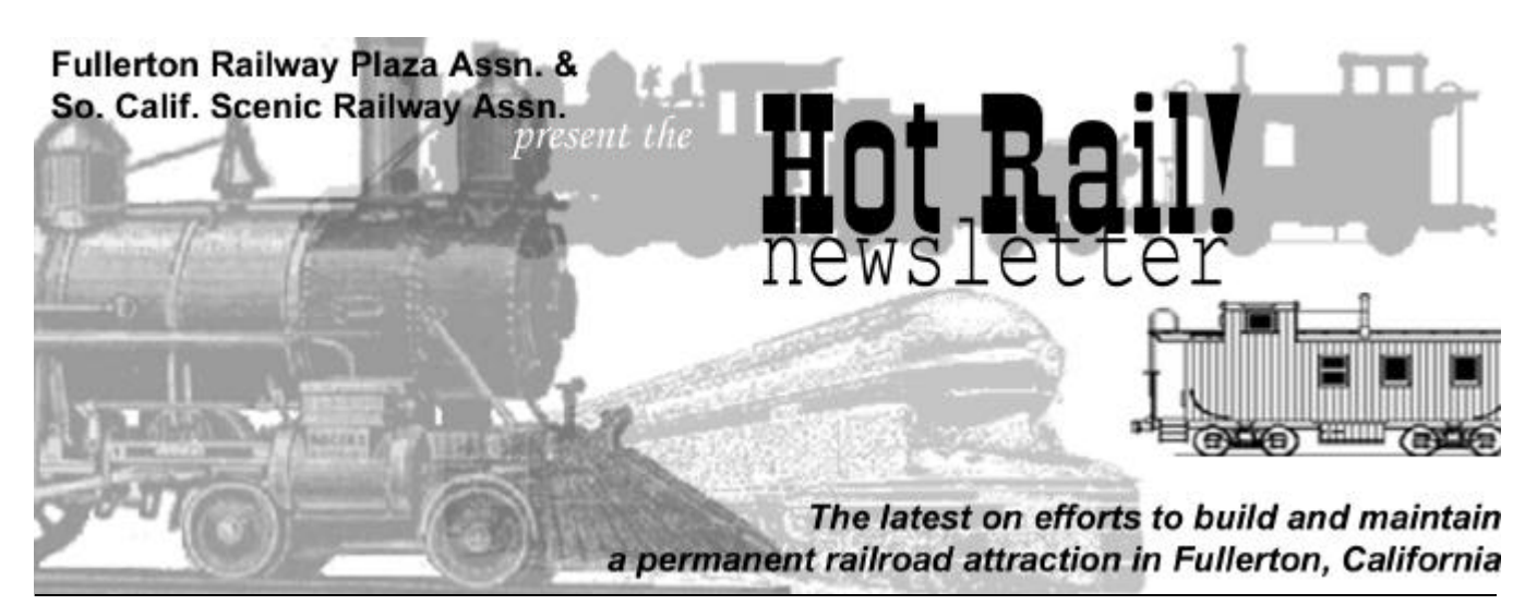
Issue II, Number 2