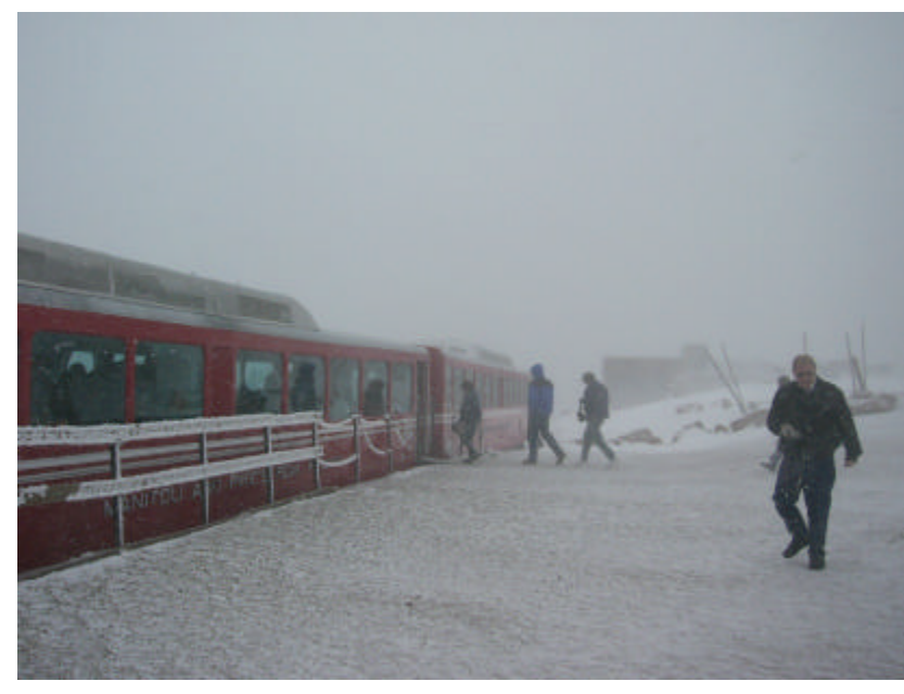
Manitou and Pike's Peak, at the summit.

ners who must spend more time behind desks than riding their trains. However, our personal supply had not been exhausted, so the return trip was pleasant.