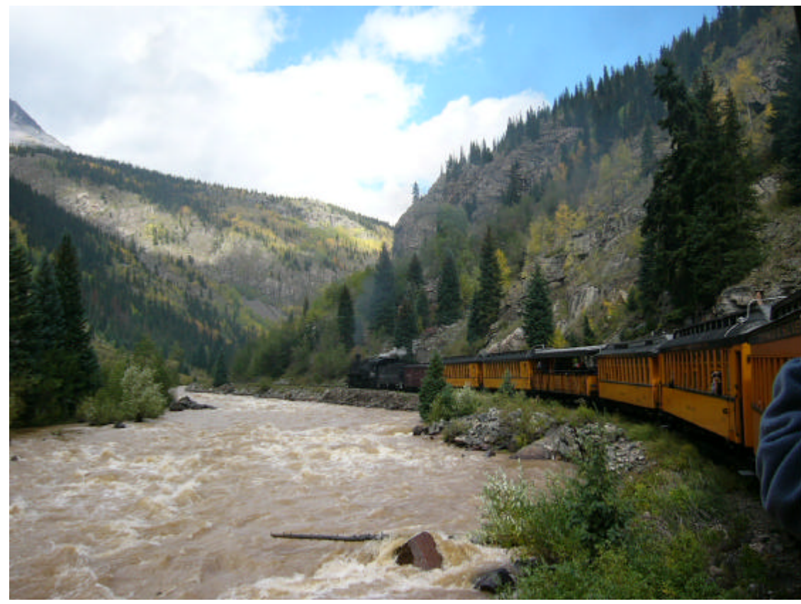
Check out the pictures on the web, in living color - http://www.scrmf.org/