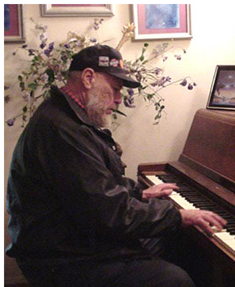
Oatmeal playing piano.