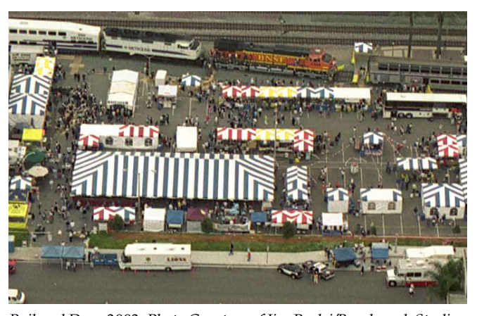
Railroad Days 2002.

Service Awards, Lots of Door Prizes Mail in RSVP form on page 7 by April 30 Hope to see you there!