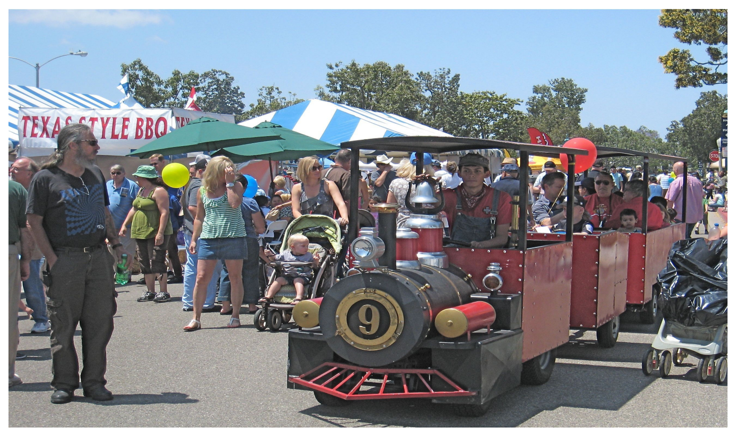
Choose-a-Choo-Choo delighted kids with free rides on the trackless train along Santa Fe Avenue.