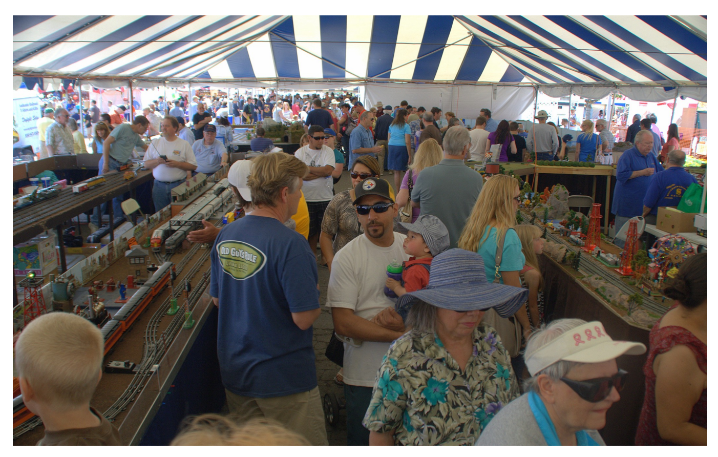
These photos are in COLOR on the web. Read the Hot Rail! in PDF at www.scrpa.net.

Kids cool off with treat by the tracks, while modular layouts draw crowds for closer looks — including details of Rio Grande car, and SCRPA's new Welcome Center (right) proved a great addition for people looking for information or connections.