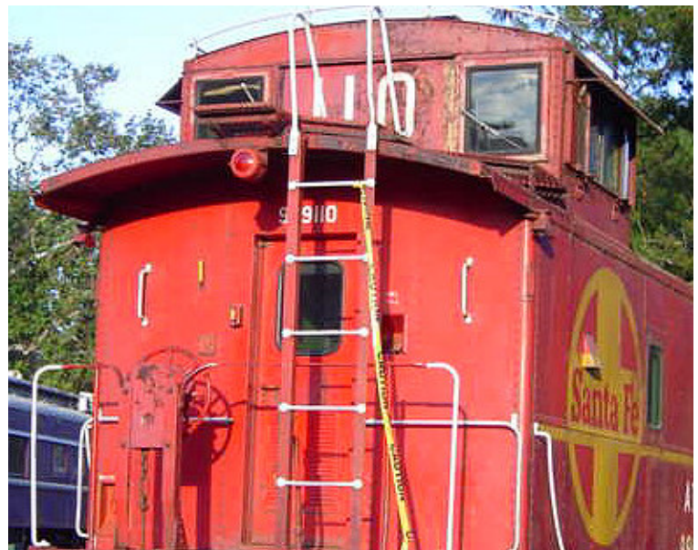
Closeup of the cupola of SCSRA's AT&SF 999110.

Primarily a term used by western railroads, a caboose was known by many U.S. railroads as a brake van or brake wagon, while in Europe they were usually known as guard vans or guard wagons. Cabooses underwent a metamorphosis through the years to better serve the needs of the railroad. First came cupolas, to allow the rear-end crew to sit atop the car, see the train, and look out for trouble, such as broken equipment, dragging cargo, overheated journals (hotboxes), et cetera. Bay window cabooses came a little later, providing better vision along the side of the train and eliminated the threat of a railroader accidentally falling from the cupola. Extended vision cupolas combined the best fea-