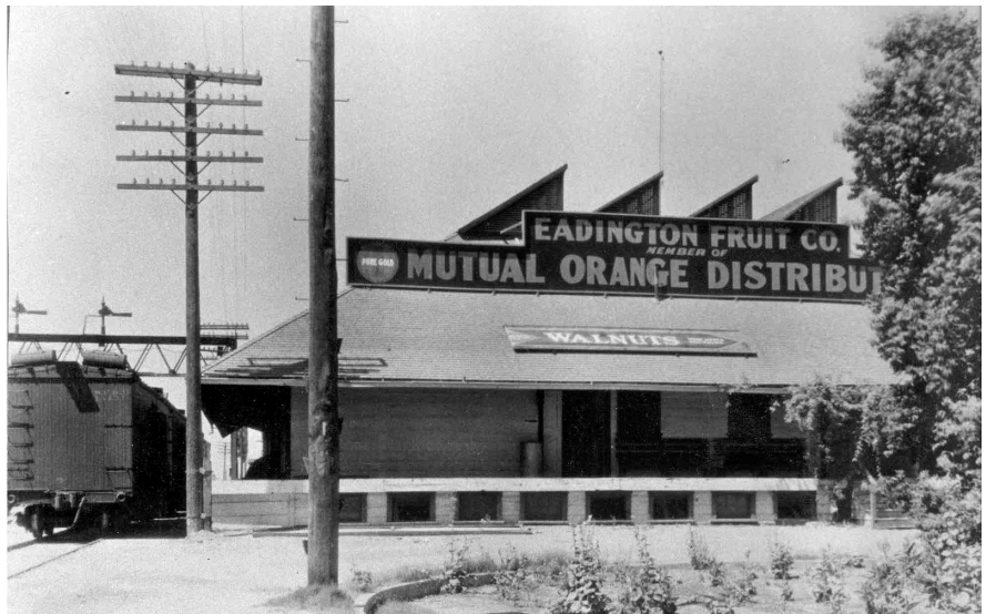
Fullerton was once the largest citrus packing and shipping location in Orange County.