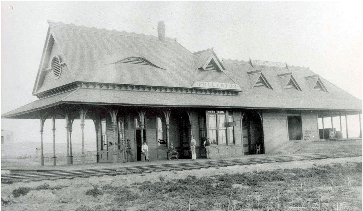
Fullerton's first train station, August 1888.

population, ever-expanding residential development and the resulting vehicular congestion has brought about unparalleled levels of passenger train service. Fullerton's decision to preserve and improve its distinctive Santa Fe railroad station as well as preserve the Pacific Electric and Union Pacific railroad stations, coupled with the preservation of its historic business district, has made Fullerton one of the distinctive cities of the region. A recently published list of best-known railfanning locales in the U.S. ranks Fullerton among the top five, in the company of Horseshoe Curve, Cajon Pass and the Tehachapis. Fullerton's ties to railroads and railroading run to its founding, survival and prosperity and continue today.