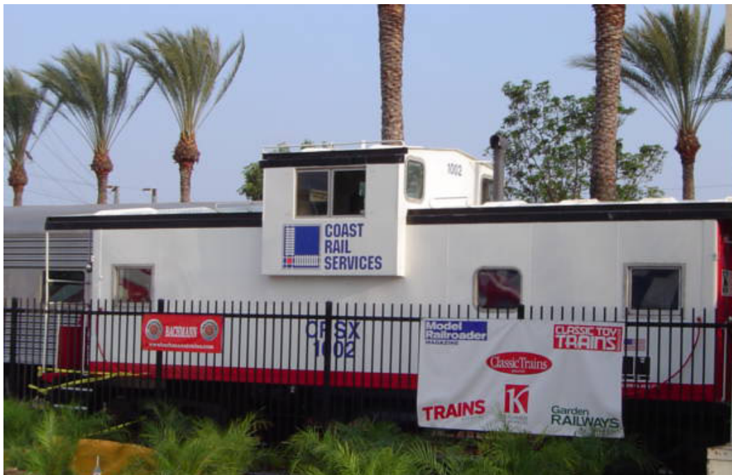
Above, Coast Rail Services 1002 at Railroad Days 2006. Below, closeup of No. 1002's extended-vision cupola.