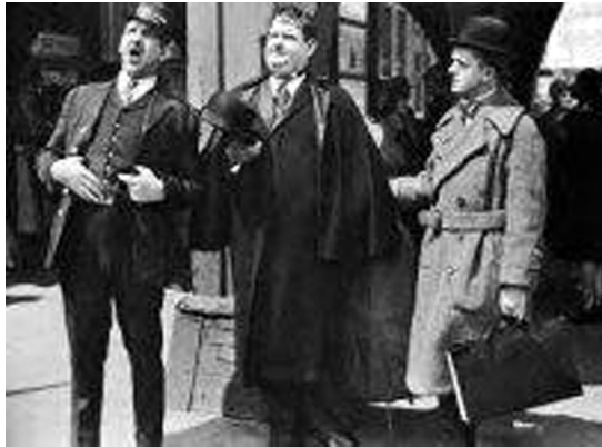
Above, Laurel and Hardy with a conductor in Berth Marks; previous page, Spanky McFarland in Choo-Choo.

We are again expecting a large attendance of over 100, so plan now to attend. Bring your friends and acquaintances interested in railroading and railroad history as it applies to Fullerton and southern California. You will hear the latest on Fullerton Railroad Days 2007 and various activities of our association. That's Wednesday, January 10, at the China Buffet, 104 West Orangethorpe Avenue, Fullerton. Mixer starts at 6 p.m. Dinner is $15 per person which includes all-you-can-eat, soft drink, and gratuity.