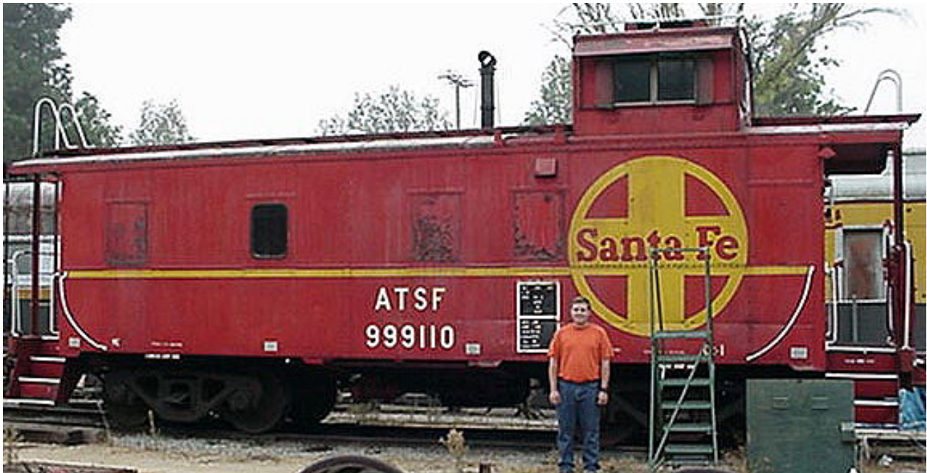
Above, SCSRA's AT&SF 999110 Cupola caboose poses with SCSRA's Jeff Barrow (photo: Sue Kientz); lower left, SCSRA's Bay Window caboose, the Southern Pacific 4049, with Dan Price in foreground (photo: Elliot Alper); lower right, a closeup of 4049's bay window (photo: Sue Kientz).

tures of both a standard cupola and bay window caboose. The cabooses at Fullerton represent all three styles.