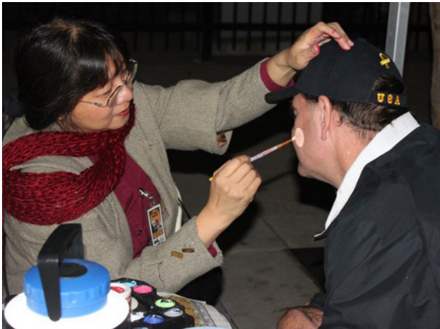
SCRPA volunteers staffed a number of tents that offered fun freebies to the public, like face painting.

See more Community Celebration photos on pages 8-9