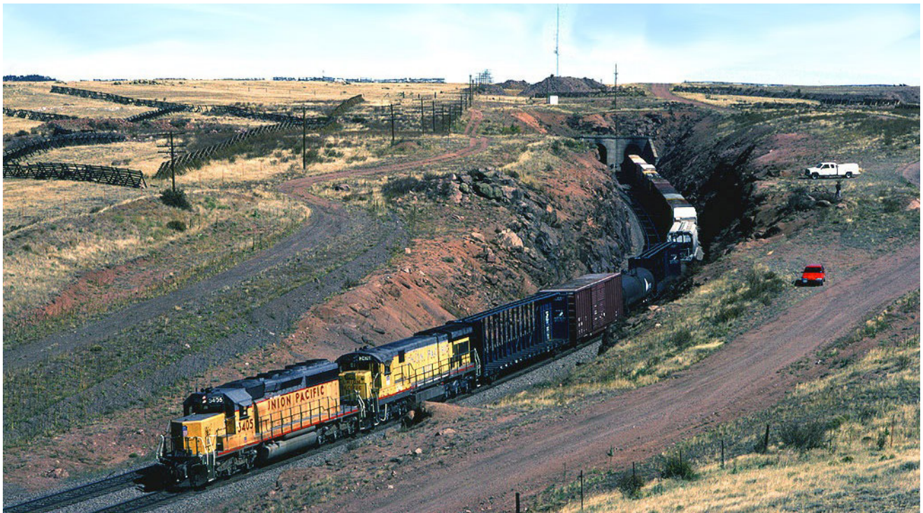
Western portal of the Hermosa Tunnel at Sherman Hill, Wyoming.