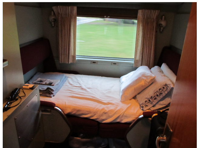
Two interior views from the private car Wisconsin, shown above.