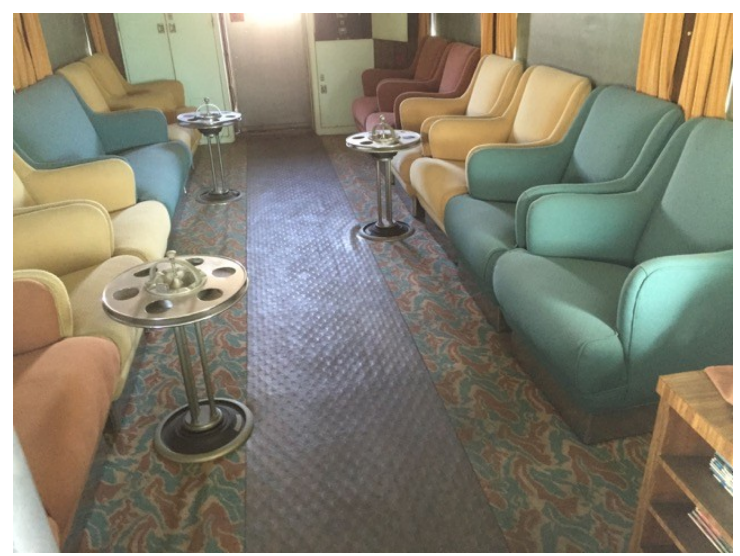
1940s style décor includes pastel seats and standing ash trays in UP 5001 lounge area.

ROC met with the local representative from Axalta Coatings and